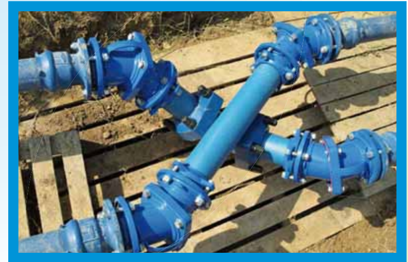
▲ In some cases, KAMELEO is the only possible solution.

Thanks to the multiple junctions and version options, the KAMELEO range offers a large number of combinations that guarantees a bespoke solution every time.