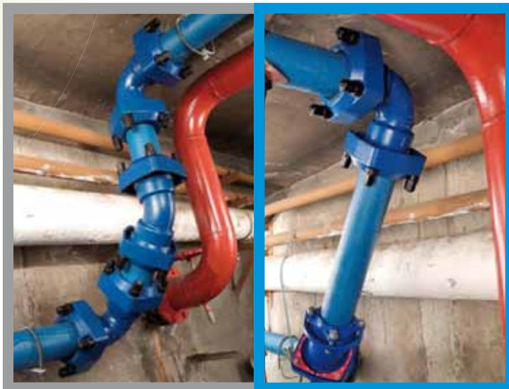
▲ Without KAMELEO 5 traditional fittings are needed