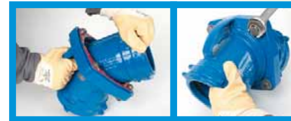
▲ Continuous angle adjustment